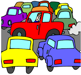
Being safe in the parking lot at school is a must!

We believe in fostering relationships between staff, parents, and the local community. We believe in a safe and positive school environment where everyone is treated with respect. We believe that all children can learn through experiences and real life applications.