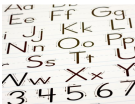
A new beginning to the school year is here!

We believe in fostering relationships between staff, parents, and the local community. We believe in a safe and positive school environment where everyone is treated with respect. We believe that all children can learn through experiences and real life applications.