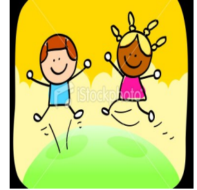
Having fun before and after school!

Bus Driveway: The east side of our school is designated as our bus transportation drop off and pick up. Please do not use this area to drive through before or after school.