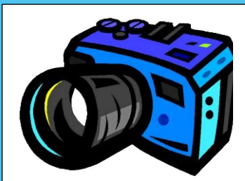
Picture Retake Day is October 25th