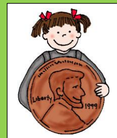
Penny Carnival – October 28th